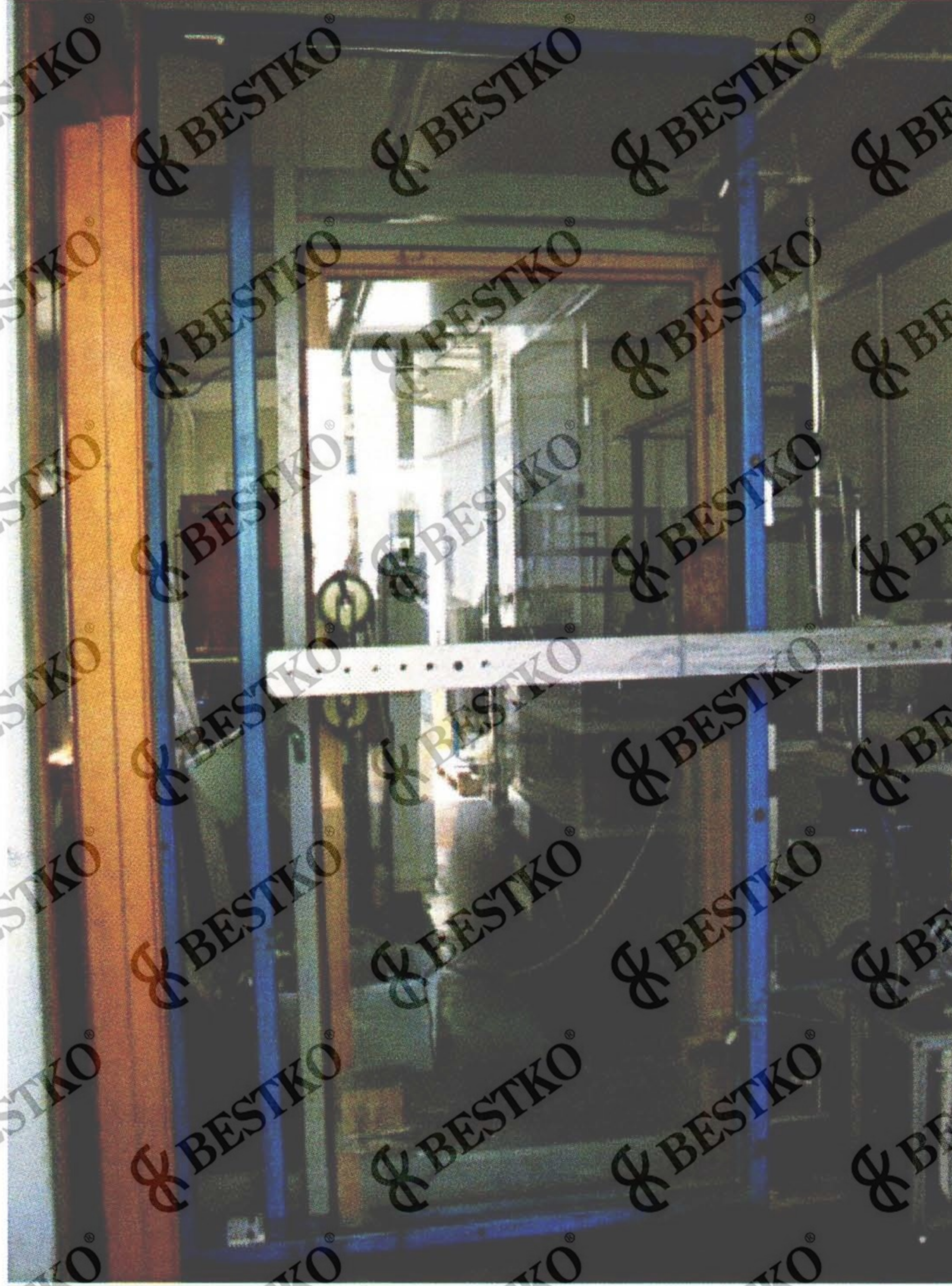
Test Set up Photograph:

The Hong Kong Standards and Testing Centre Ltd.