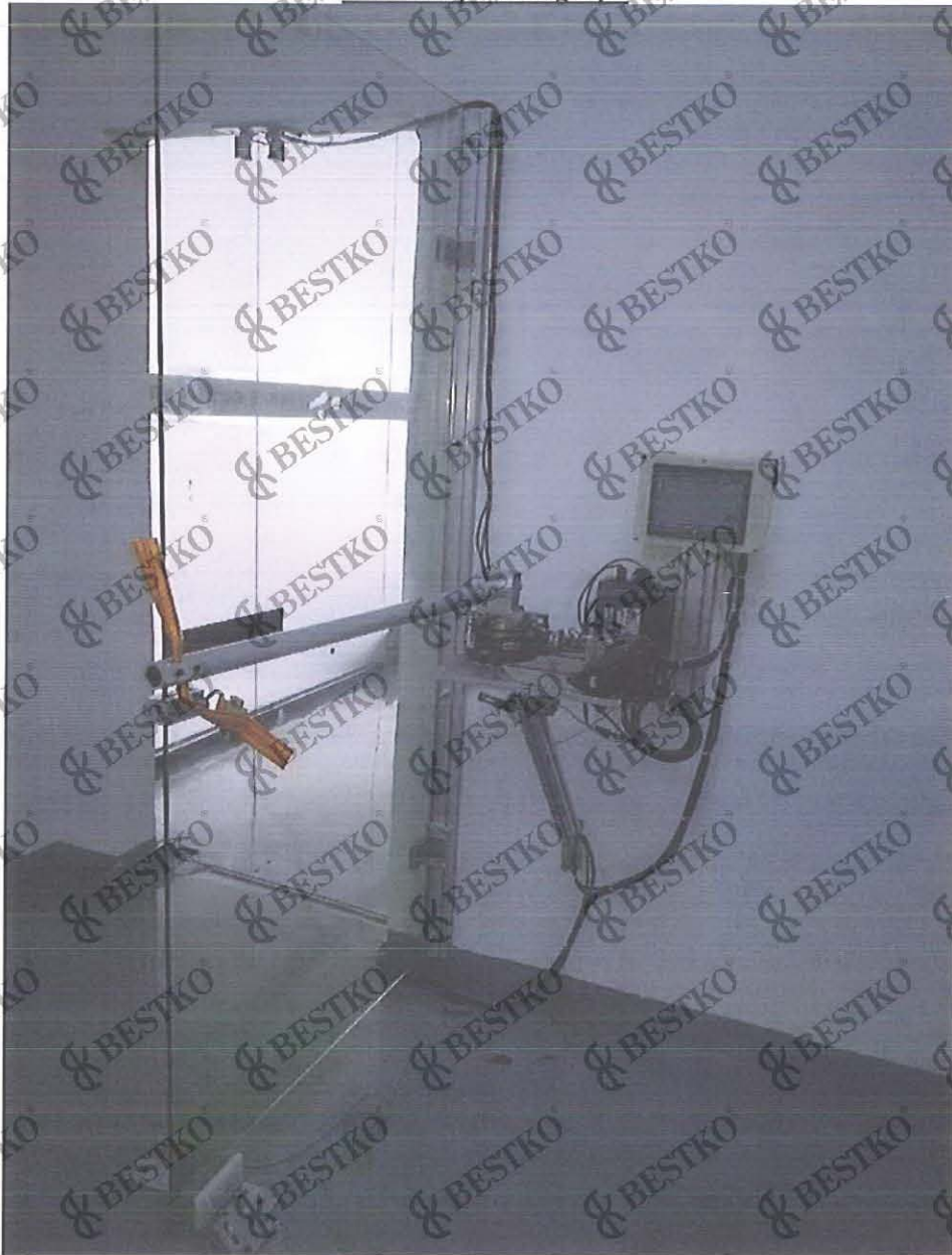
Test Setup Photograph

The Hong Kong Standards and Testing Centre Limited 10 Dai Wang Street, Tai Po Industrial Estate, Tai Po, N.T., Hong Kong Tel: +852 2666 1888 Fax: +852 2664 4353 Email: hkstc@stc.group Website: www.stc.group