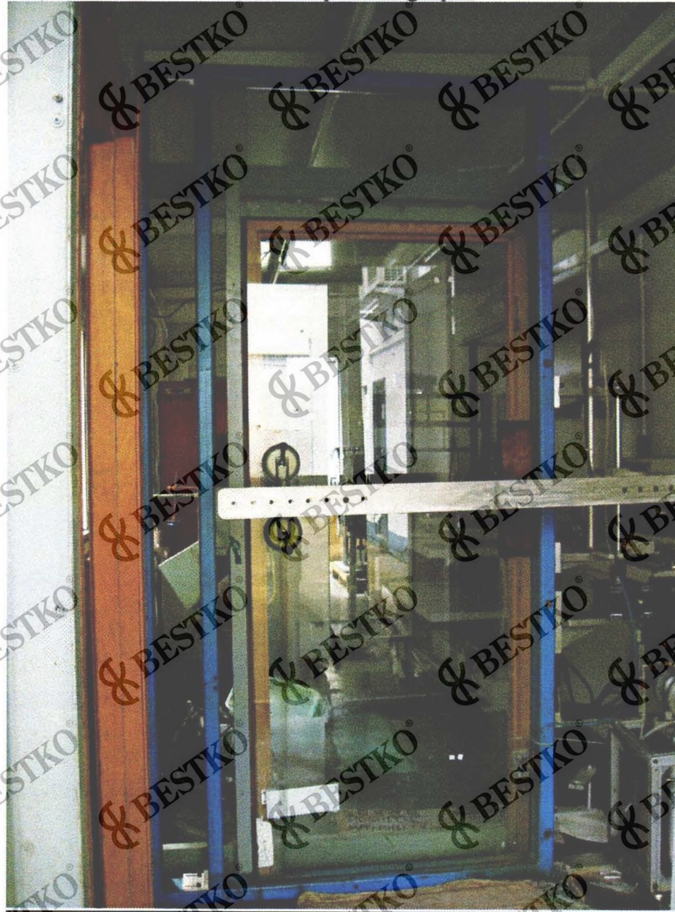
Test Set up Photograph:

The Hong Kong Standards and Testing Centre Ltd.